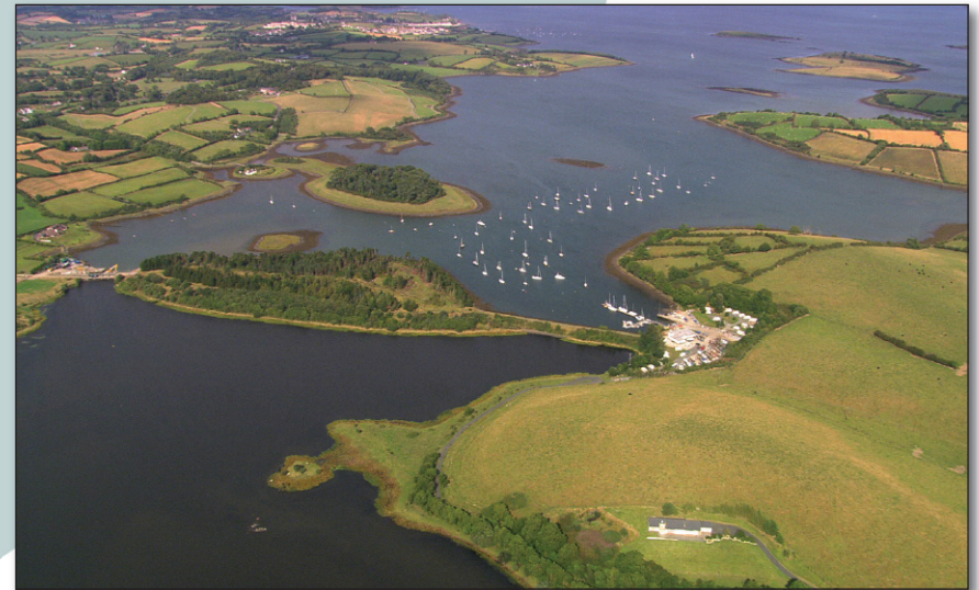
Strangford Lough is a sea lough, being connected to the Irish Sea by the Narrows.