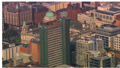
Belfast City Hall in Donegall Square emerges from behind tall modern buildings.