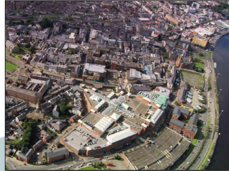
The River Foyle curves through the city of Derry.