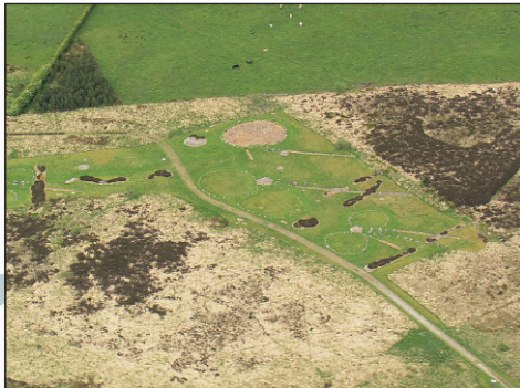
The Beaghmore stone circles, which were possibly a prehistoric observatory, date from between 2000 and 1200 BC.