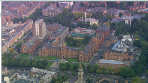
Queen's University, Belfast, the Province's most prestigious seat of learning. The main building dates from 1849.