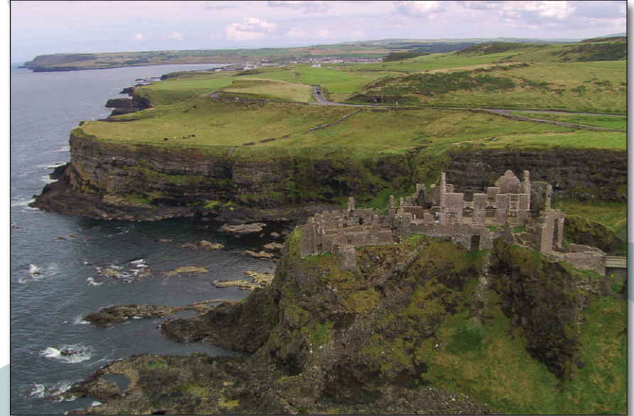
Dunluce Castle, dating back to the fourteenth century, was the seat of the MacDonnells, chiefs of Antrim.