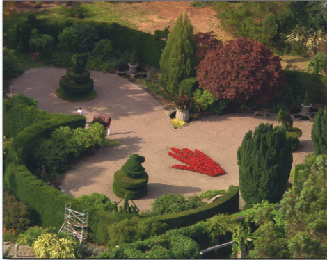
The Red Hand of Ulster in the world-famous gardens at Mount Stewart, created in the 1920s.